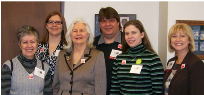
Arts Constituents meet with Rep. Kathy Byrnaert, Dist. 23B.

(Legislator photos continued from page 2.)