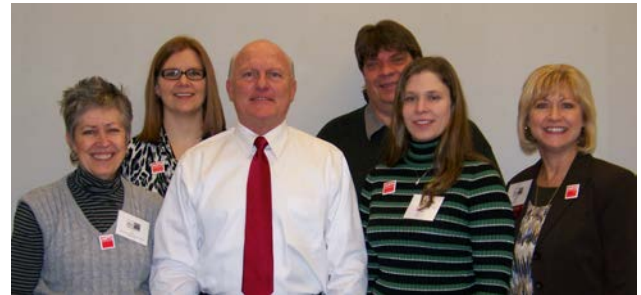
Arts Advocacy Day, March 8, 2011. Arts Constituents meeting with Senator Mike Parry (center of photo).