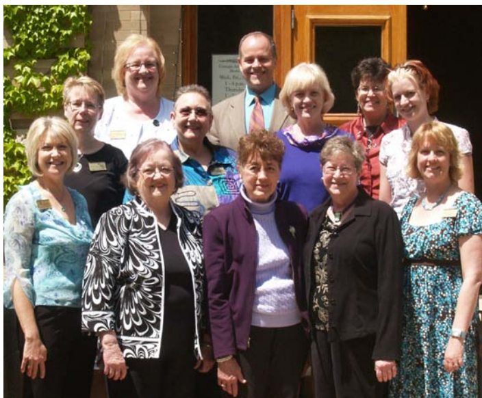
Prairie Lakes Regional Arts Council Board Members and Staff at the Opening Reception, May 17, 2009.