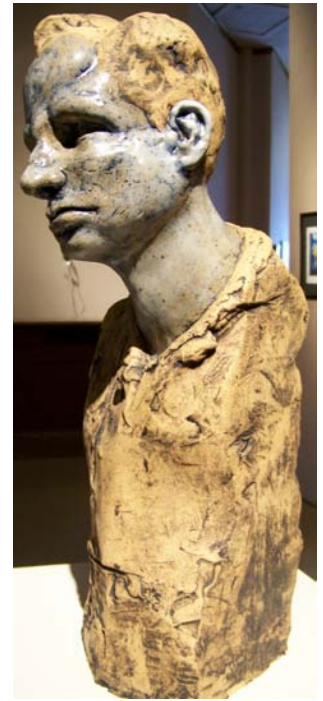
2nd Place - $150 “Untitled Man”, Ceramic Sculpture by Christopher Kanyusik, Mankato