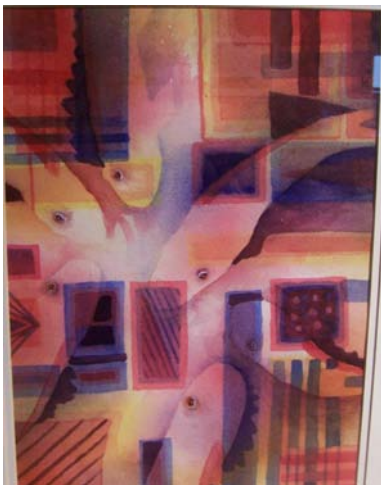
4th Place - $100 “Ghosting”, Watercolor Painting by Trudi Remund, Waseca