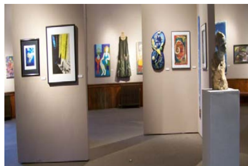
Rotunda Gallery at Carnegie