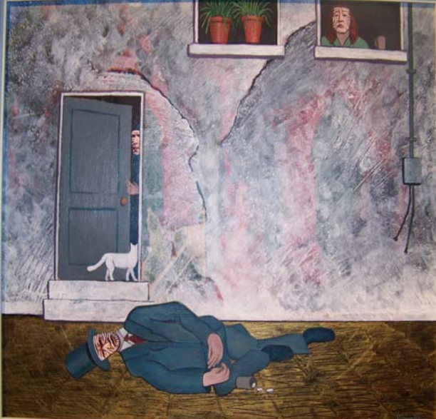
1st Place - $200 “All That Glitters Is Not Gold”, Acrylic Painting by Charlie Putnam, St. Peter