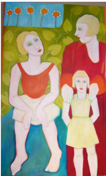
4th Place - $100 “Three Figures With Flowers” Oil Painting by Pam Bidelman, St. Peter