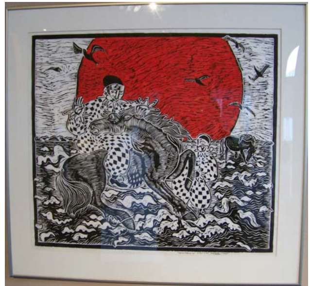
2nd Place - $150 “Quo Vadis 06” , Mixed Media by Arnoldous Grüter, Mankato