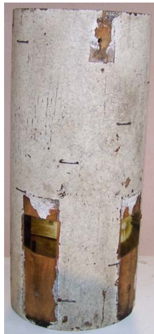
3rd Place - $125 “Loss” Mixed Media by Jon Knecht, Mapleton