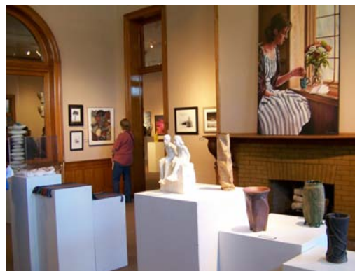
Fireside Gallery at the Carnegie