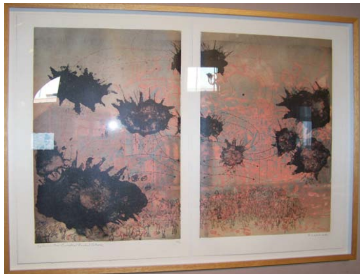
3rd Place - $125 “System of Explosions Over Complex” Mixed Media by Erik Waterkotte, North Mankato