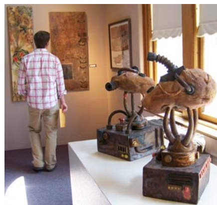
Hope Cook Gallery at Carnegie