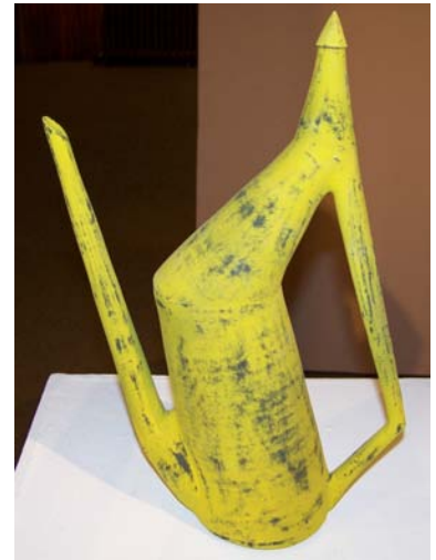
2nd Place - $150 “Rustic Love”, Ceramic by Matt Bright, Mankato