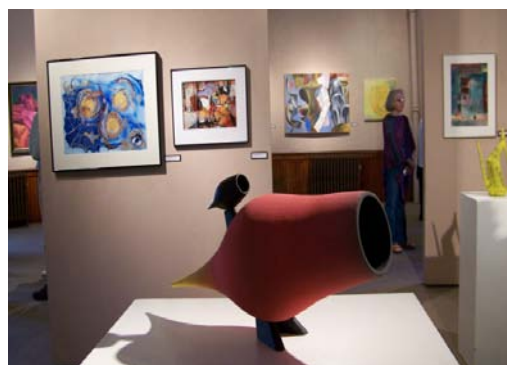
Rotunda Gallery at Carnegie